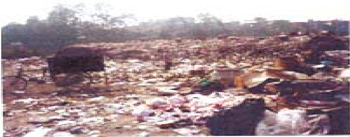
People, around the plastic waste