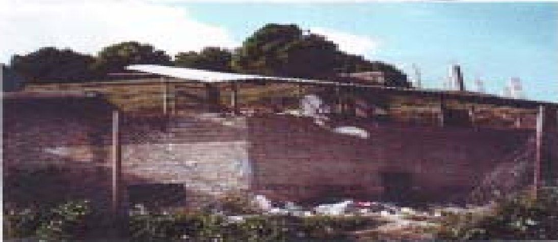
Incinerator inspection by external delegation