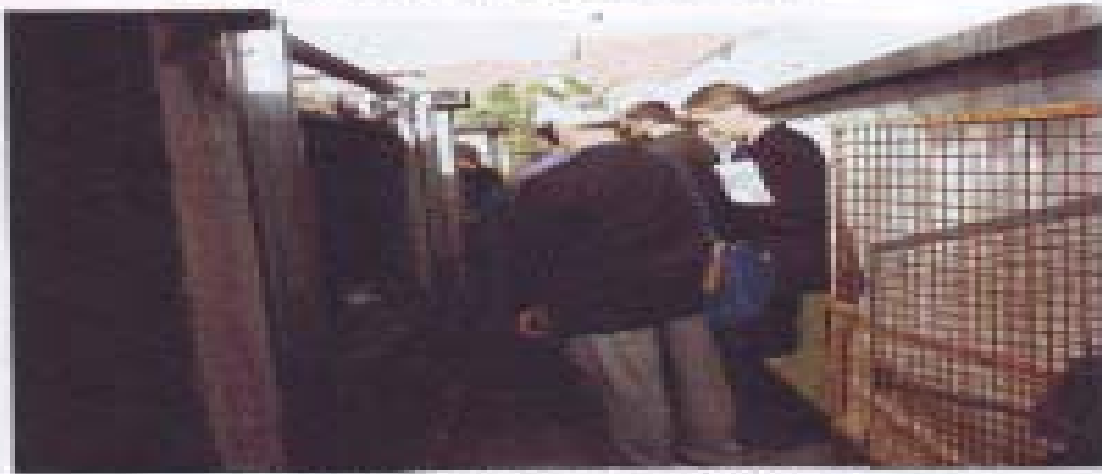
SEF with SEMSI delegation at Nigarakot