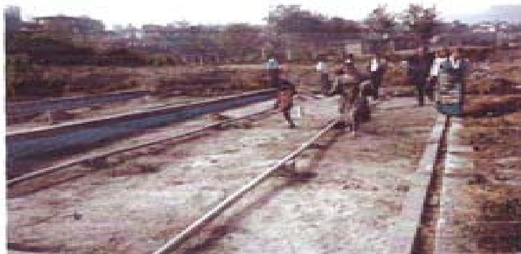
Sorting of Plastics from collected garbage : Teku