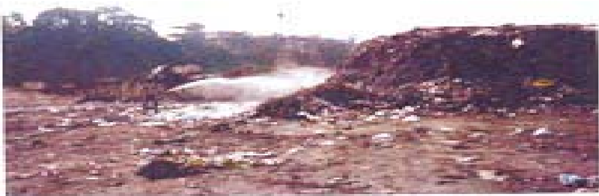
New charges from TDF in plastic: the nuisance for generations